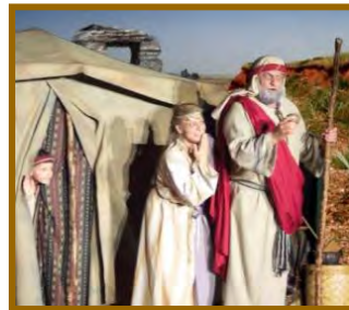
6:45 pm Session 3: "He Makes Me Laugh"

8:30 am ..... Breakfast 9:45 am ..... Session 2: Reflecting Christ in the Tempest 12 noon..... Lunch 1:00-5:00 pm ..... Free Time (Crafts, Lake, Rest) 3:00 pm ..... Afternoon Tea 5:30 pm ..... Dinner